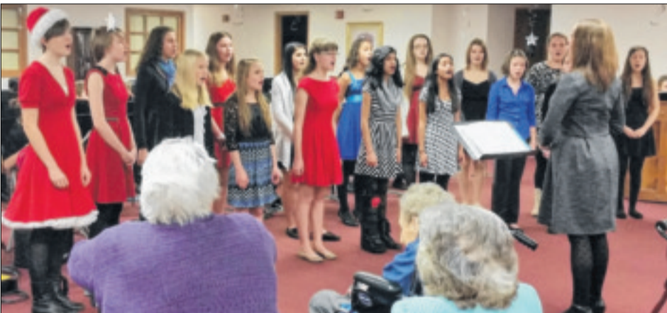
The girls chorus from Watts Middle School in Centerville recently performed at Laurelwood Senior Living Center.