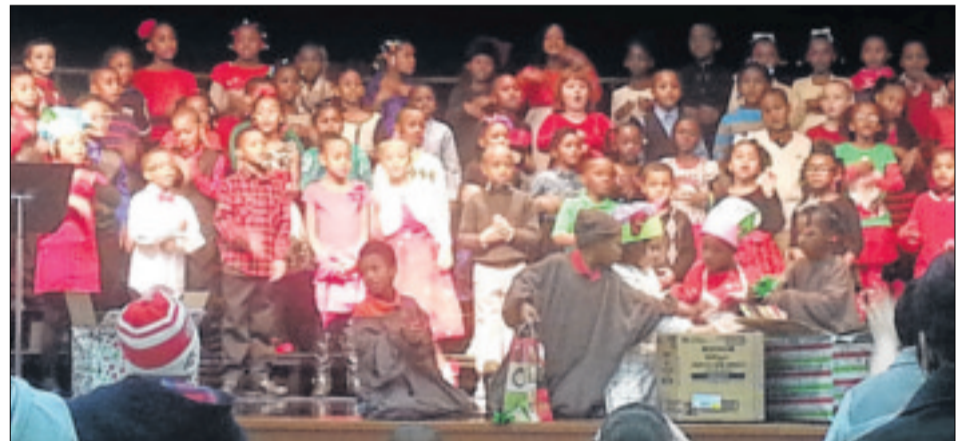
Students at the Trotwood-Madison Early Learning Center perform their holiday program, titled "Baking Cookies with Santa," in front of friends and family Dec. 16.