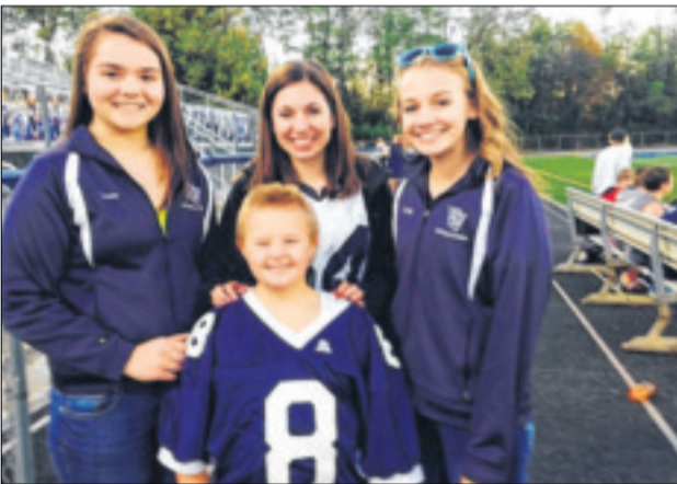
Valley View Junior High School students gather at the field.