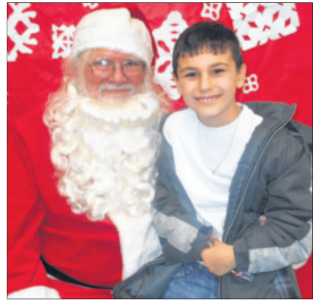
Santa visits students at Frank Nicholas Elementary in West Carrollton.